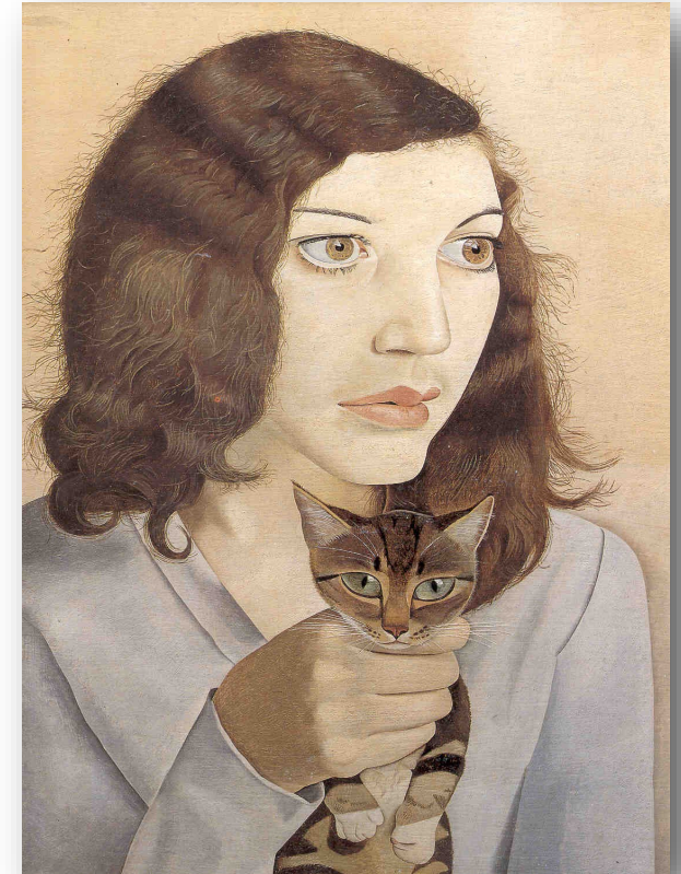
Girl with a Kitten Lucien Freud 1947