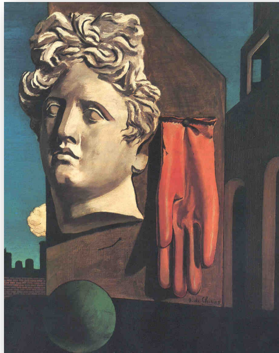
Song of Love Giorgio De Chirico 1914